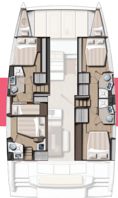
5 cabins and 4 baths version Version 5 cabines / 4 sdb