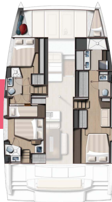
Owner's version 4 cabins and 3 baths Version propriétaire 4 cabines / 3 sdb