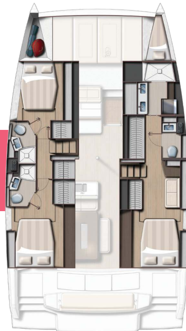
Owner's version 3 cabins and 3 baths Version propriétaire 3 cabines / 3 sdb

* Equipment according to chosen Pack and options - Equipement selon Pack et options choisis